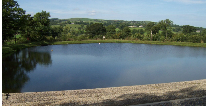
Chatburn Water From The Clubhouse

The fun starts at 2 pm registration begins at 1pm. Cost £3 each player.